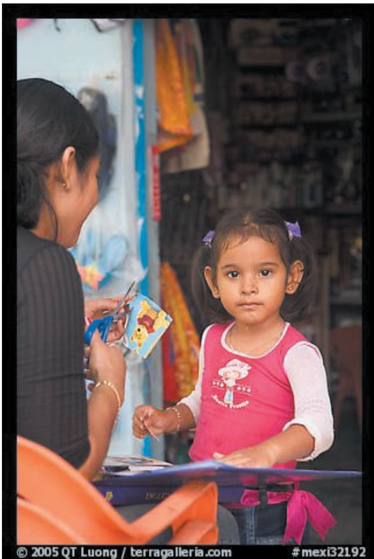
© 2005 QT Luong / terragalleria.com #mexi32192

— Discourage the use of teenagers as nursery workers. — Increase supervisors for large groups — Prohibit situations in which one adult is alone with children in changing areas or restrooms. — Use a "claim check" procedure so that children are released only to a parent, guardian, or other authorized person presenting the "check."